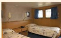
Junior Cabin Coral I