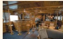
Lounge Coral II

It is an elegant, classic Mega Yacht for 20 passengers. It is perfect for explorers who want to feel the islands with privacy and supreme comfort; its cruising speed allows to have less time in traveling and more time on visiting the islands. The ample lounge with a classic marine decoration; large windows that allow our guests to have an amusing panoramic view of the islands and its wildlife; comfortable lounge couches to read, sleep or relax, give a different ambience and environment to live Charles Darwin's paradise.