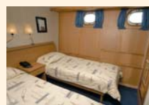
Moon Suite Coral II